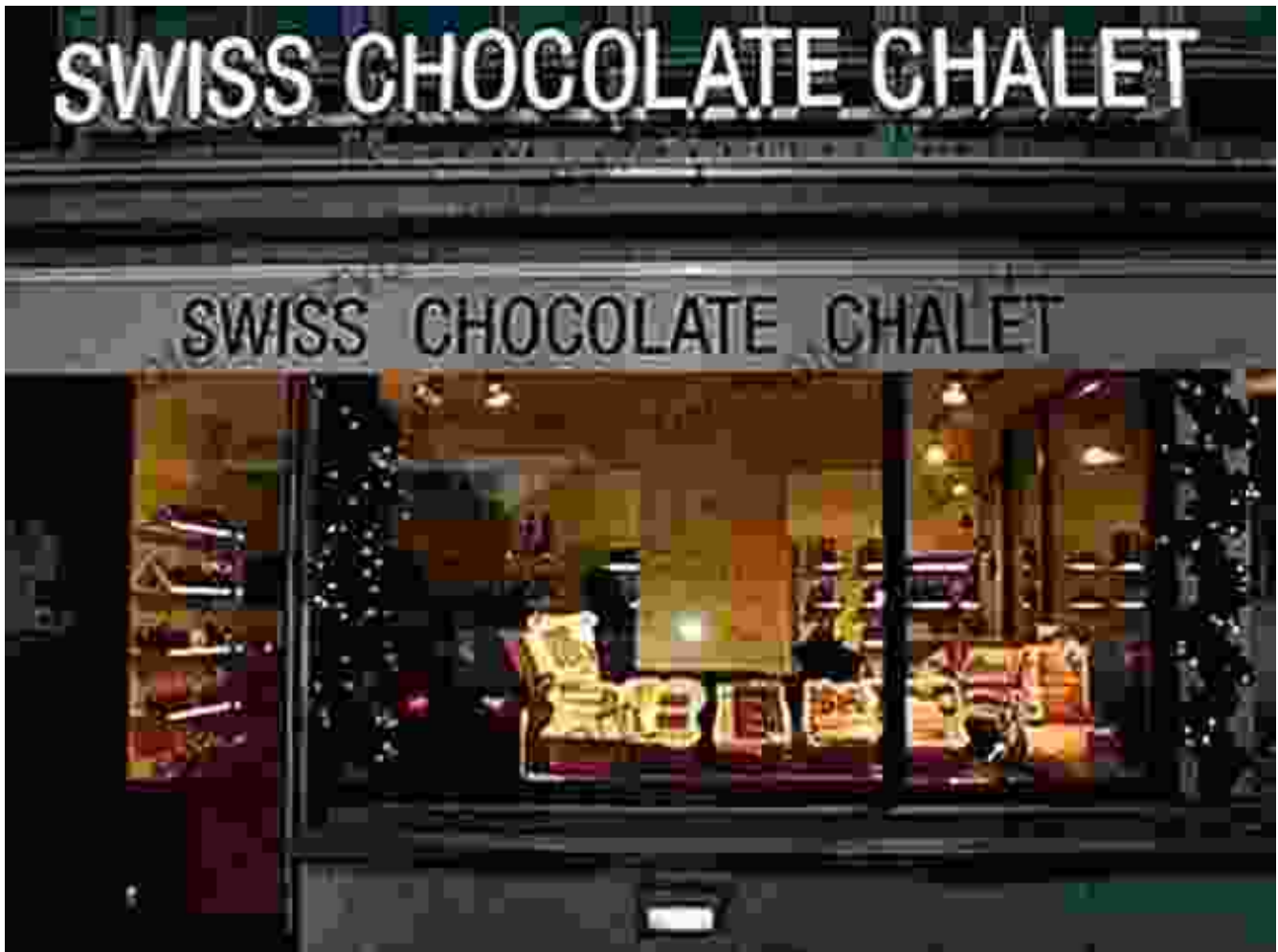
A chocolate shop in Interlaken, Switzerland

Chocolate has a deep cultural significance in many societies around the world. In Mexico, chocolate is used in traditional dishes such as mole sauce and champurrado. In Switzerland, chocolate is a national symbol and is used in a variety of confections, including Swiss chocolate bars and fondue. In Belgium, chocolate is a delicacy and is often paired with beer or coffee.