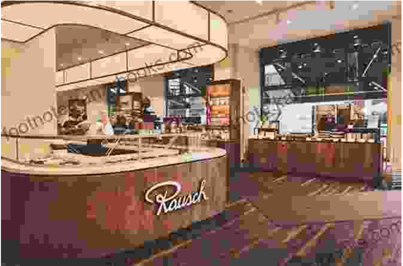
A chocolate factory in Berlin, Germany, in 1896