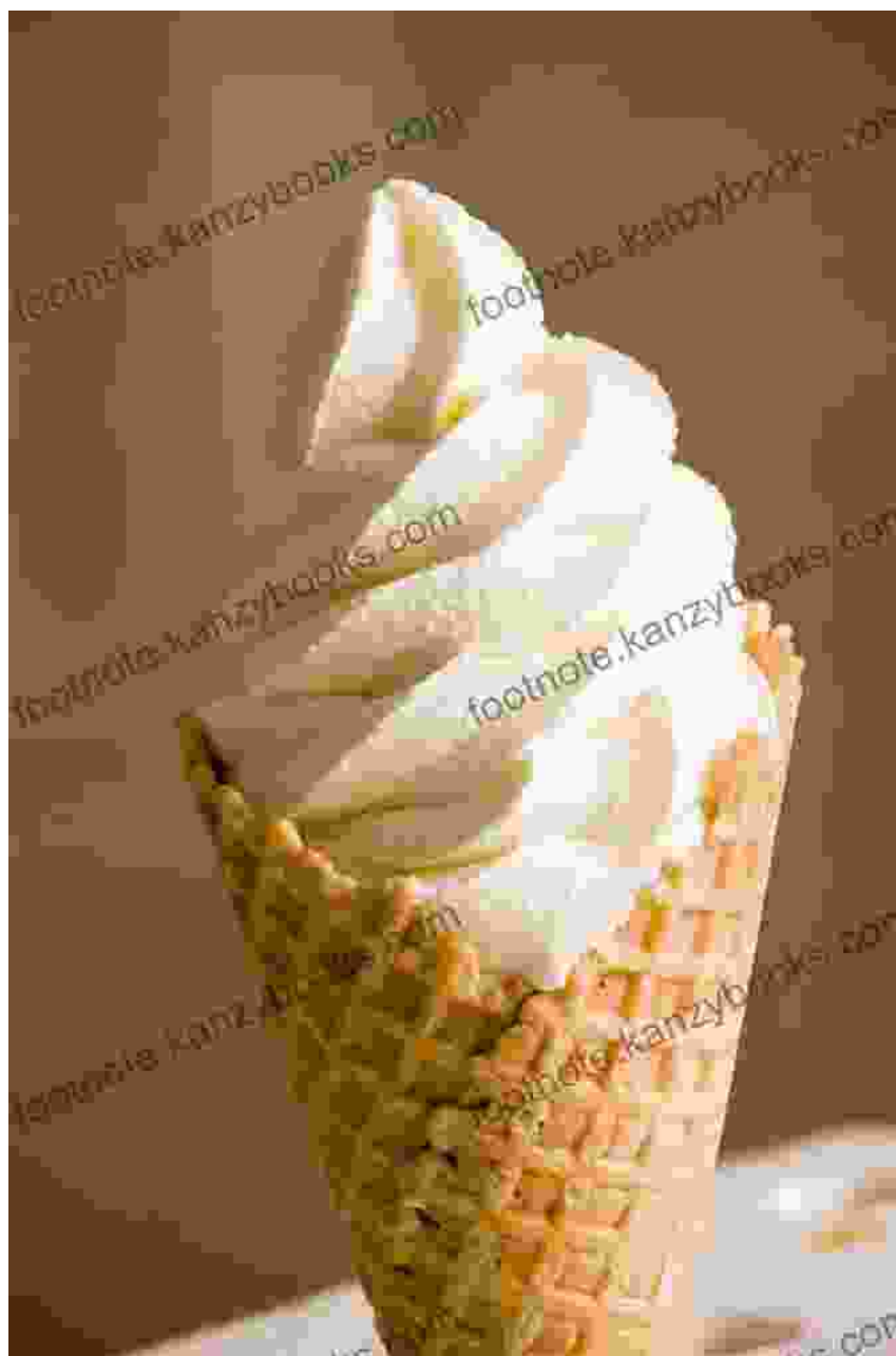
Image of a scoop of colorful ice cream in a waffle cone