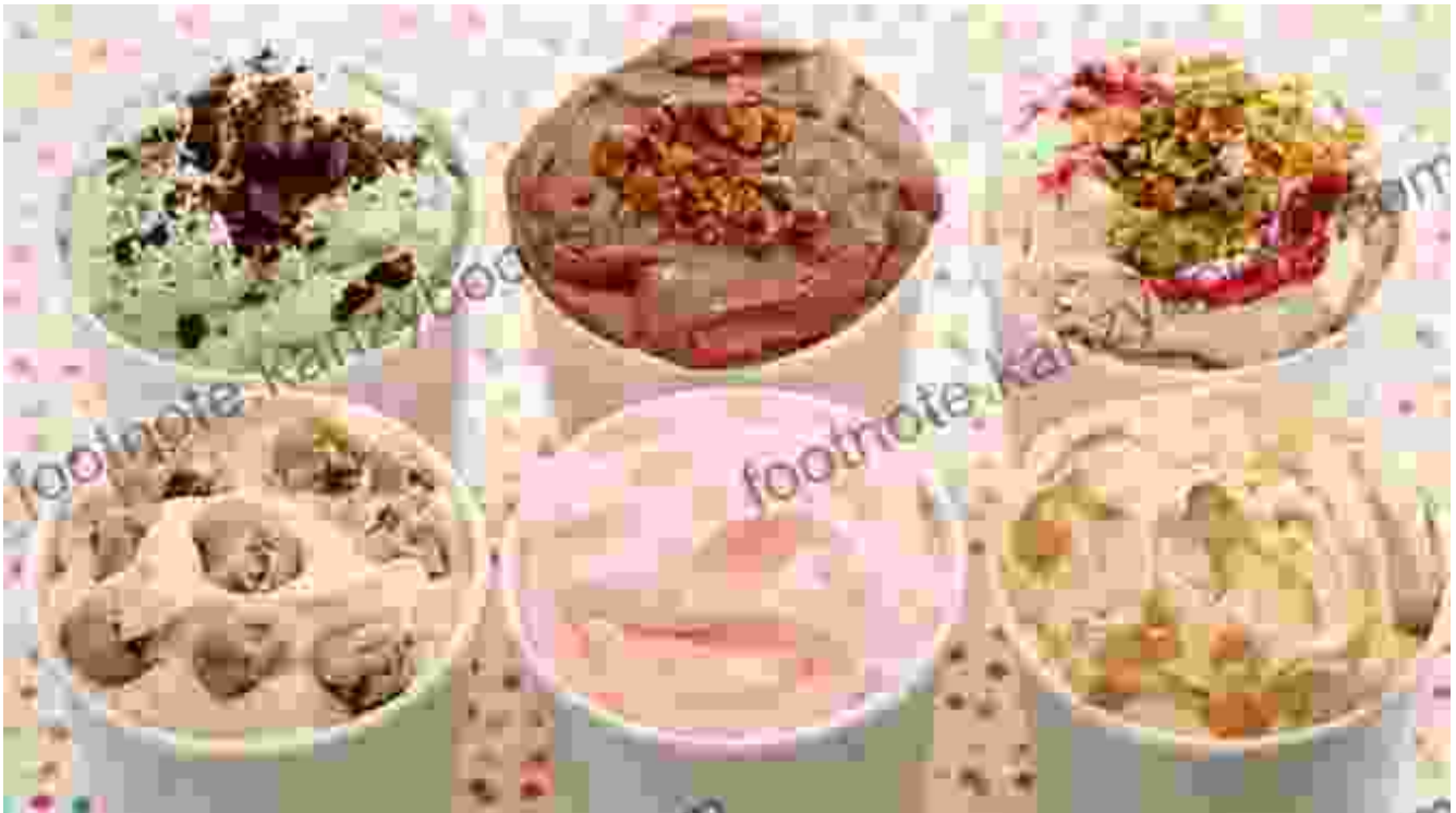
Image of an assortment of homemade gelato and ice cream