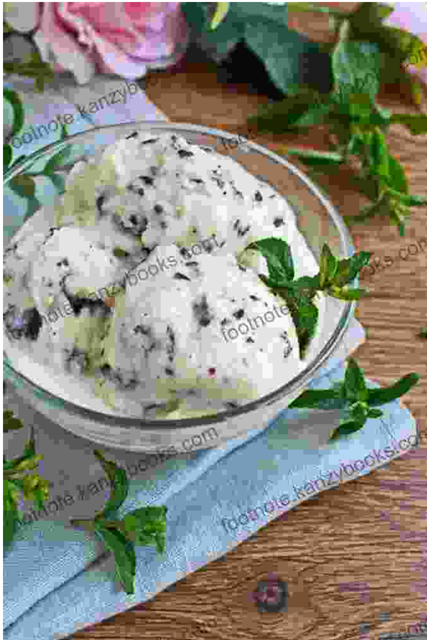
Image of a gelato topped with fresh fruit and herbs

With this culinary guide in hand, you hold the key to unlocking a world of sweet delights. From classic gelato to inventive ice cream flavors, the possibilities are limitless. Embrace the joy of homemade frozen treats and create memories that will warm your heart and tantalize your taste buds.