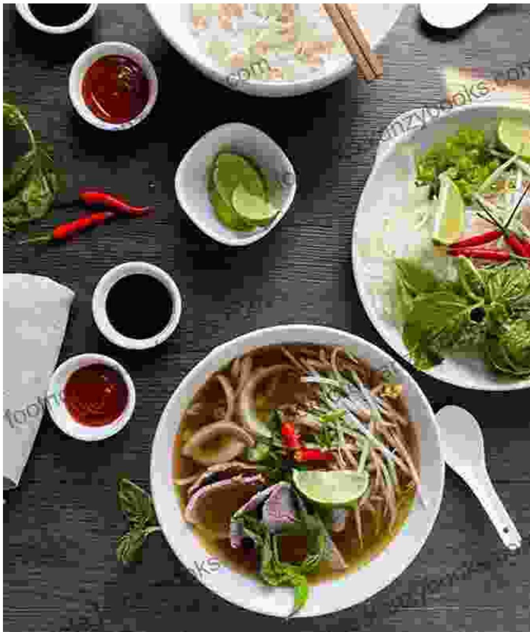
Pho: The Comforting Heart of Vietnamese Cuisine

sunny-side-up egg. And for a taste of Indonesian cuisine, immerse yourself in the aromatic flavors of nasi goreng, a flavorful fried rice dish that captures the essence of the Indonesian archipelago.