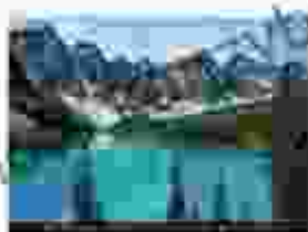
Microsoft Exchange Server PowerShell Essentials

Step-By Step To Download "Microsoft Exchange Server PowerShell Essentials book" eBook: